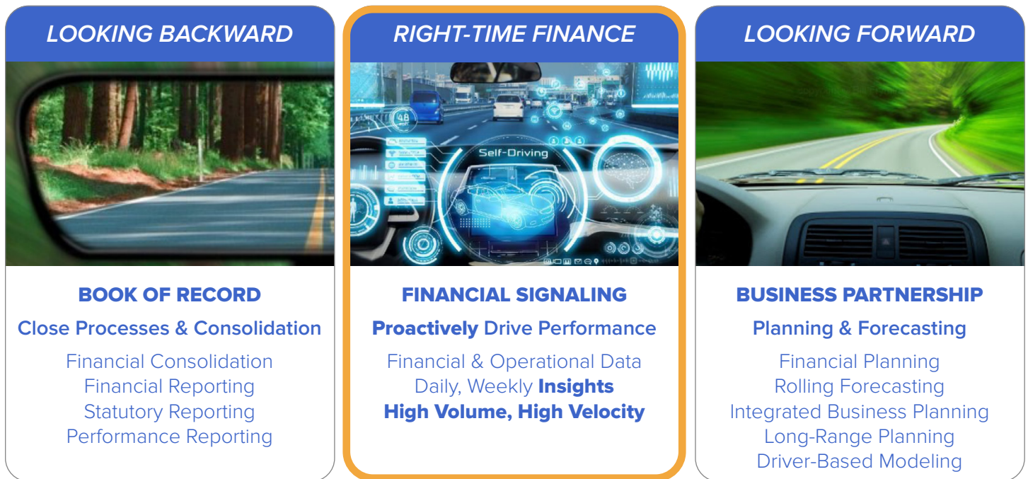
Figure 1: Financial Signaling

Sounds logical, right? But how do successful Finance teams make the leap? To start, when seeking to unleash their true value, Finance teams can't ignore the basics. They must instead conquer the complexity of basic processes — such as the financial close and planning processes — and be prepared to lead at the speed of the business.